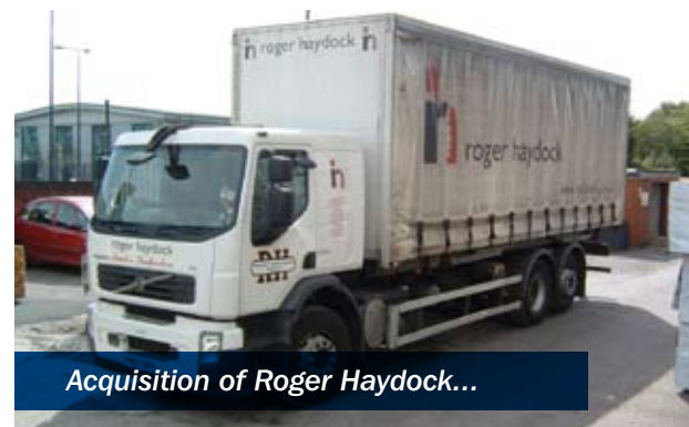
Acquisition of Roger Haydock...