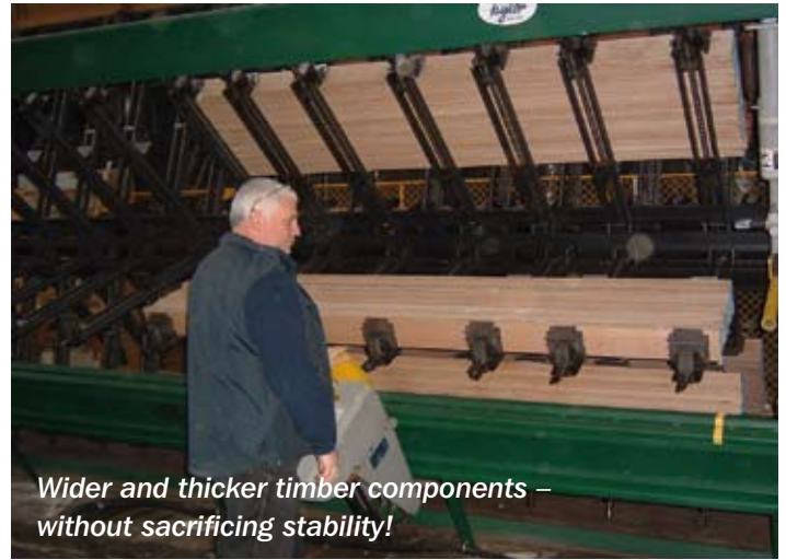
Wider and thicker timber components – without sacrificing stability!

We can produce components up to 5m long x 900mm wide by 150mm thick